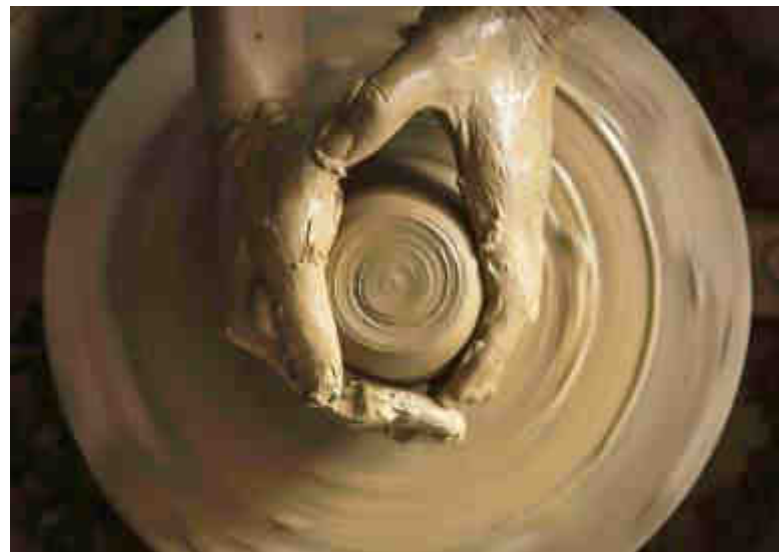
Creative Hands on wheel

The history has not been kind to the craft persons who for centuries have shed their blood, sweat, and tears. In the new rising industrial society, machine-made goods had created an over powering impact on the consumers to the exclusion of handcrafted items. The cumulative effect of these factors resulted in downfall of market potential for handicrafts and consequent unemployment and under-employment among craftsmen.