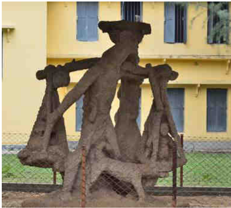
The Santal Family -1938, Santiniketan.

'Out of the nine artists invited, five submitted their proposals and amongst them only one submitted