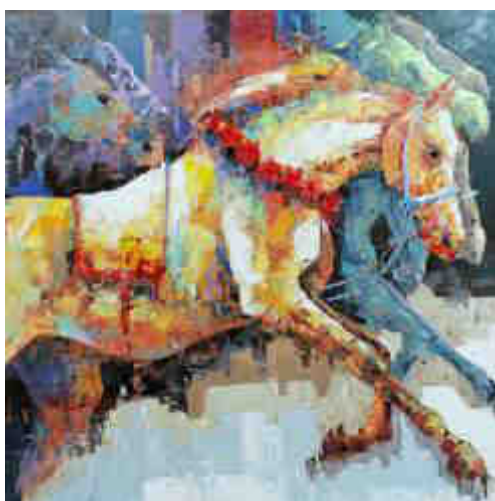
Seven Horses by Sanjay Chakraborty