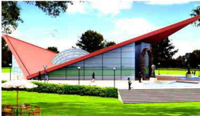
Shaheed-i-Azam Bhagat Singh Memorial