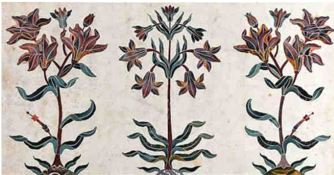
Floral Design on Wall of The Taj Mahal, India

A motif in art is a repeating pattern, arrangement or a specific form or figure used in a creation of art. Its recurrence is its most characteristic and interesting aspect. It is a single or a mosaic of elements which is typically distinct in a design or composition. It may be of various types such as geometrical, figurative, floral or anything related to plant, traditional, historical, or even abstract. A specific motif may impart a significant meaning to the theme and help in reinforcement of the main idea. Motifs can be disposed in a number of ways to impart a 'rhythmic movement' in the visual art and highlight the subject matter. They are generally used to draw the attention of the onlookers and win their admiration. Floral and plant motifs have been in use in art since ancient times. No art in the world could afford to ignore the nature's gift (flowers) in their themes. This is evident in various historic structures and architectural forms. These were used in different forms ranging from single motifs to elaborate configurations, display of plant life in natural forms to complex spool of plant vines, plain to intricate patterns and from very simple to highly elegant designs. Designs based on plants were one of the