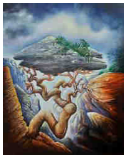
Rockscapes 1 by Ramesh Rana