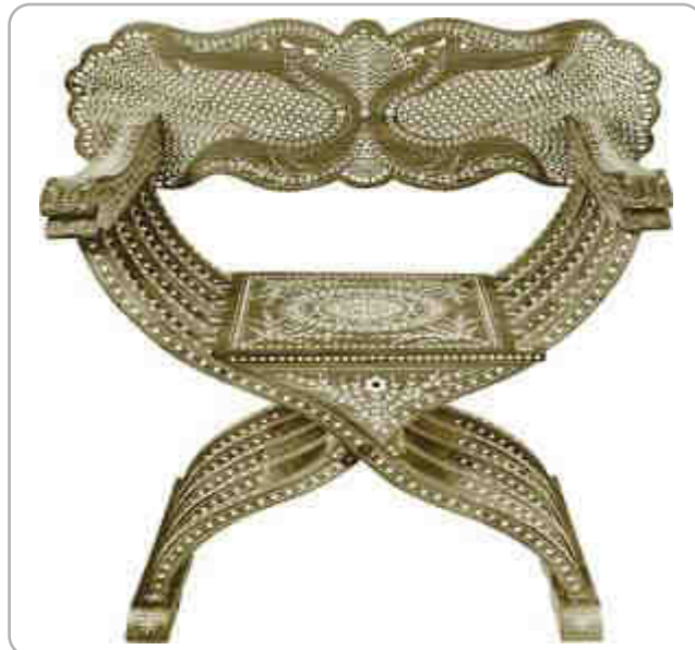
Inlay art work in furniture