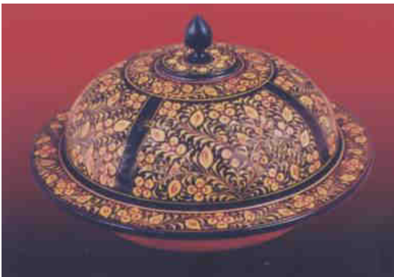
Lecur Turning Work

craftsmanship. Even the Taj at Agra built by Shah Jahan in the memory of his beloved wife Mumtaz Mahal, is a marvelous example of a special art of that area known as stone-inlay work. Even today, beautifully designed semi precious stone-inlay work of Agra is in demand in the form of furniture and crafts. Handicrafts are labour oriented, the personality and feeling can be found in every artistry which is to be produced to serve the society. But now-a-days things are