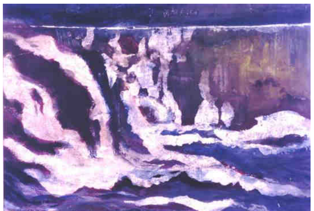
Waterfall in Collection of National Modern Art Gallery