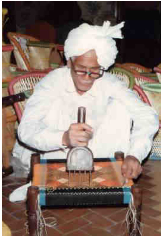
Creative hands weaving Chorwki

From the ancient times, the life of the people has been dominated by religion and their culture, which has developed around the temples. Folklore and drama have for their