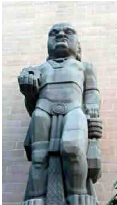
Yaksha and Yakshi by Ramkinkar Baij at Reserve Bank of India, New Delhi

He had further explained that 'these images do not relate to 'Kuber' (the god of wealth and the god-king of the semi-divine 'Yakshas'), as many