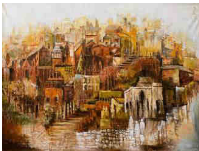
Caracole by Smita Jain