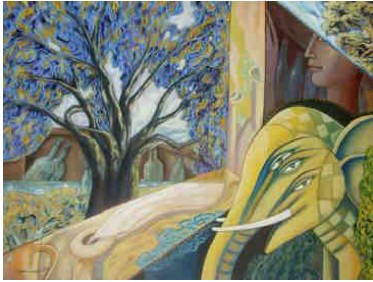
Painting by Tapan Dash

The child's nature was gradually becoming artistic, it seemed as if the surrounding nature had filled all its colors in his imagination, the calm and serene sea had inspired him to think seriously in a meditative way and the abode of Lord Jagannath inspired him to create and explore something new.