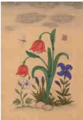
Painting by Mahaveer Swami