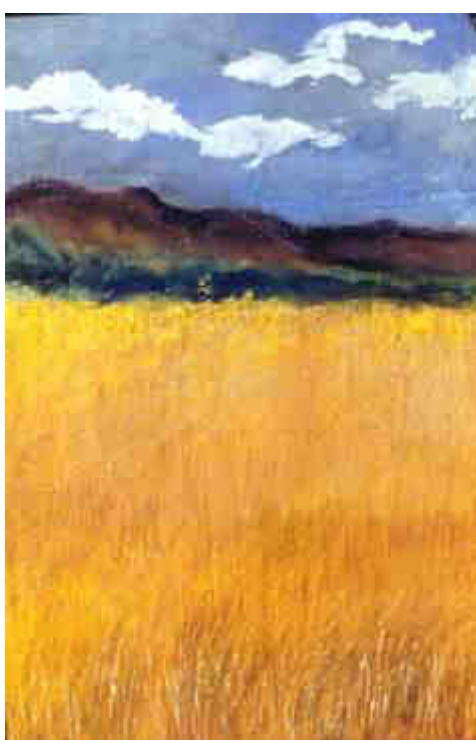
Collection - Govt Museum & Art Gallery, Chandigarh

A Study of Guru Nanak Bani with Special Reference to Japuji' 2000; and 'SRI HARMANDAR SAHIB-A Study of Architecture, Engineering, and Aesthetics' 2008. He won the Fifth Journal of the Indian Institute of Architects National Award for Excellence in Architecture (Research Category) for his first PhD in 1993. His second PhD was honoured by Guru Har Krishan Educational Society, Chandigarh, as the Best Doctorate done in 2000 at the Department of Guru Nanak Sikh Studies, Punjab University. For his Third PhD he was featured in Rajya Sabha TV Documentary on Golden Temple in 2019. His Masters in Architecture research thesis done in 1983 (The University of Queensland, Australia) has made Chandigarh's Rock Garden known throughout the world.