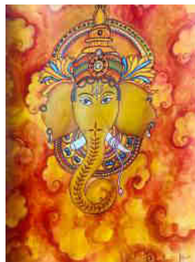
Alkaa Khanna 'Ganesha' Acrylic on Paper 12x16 Inches

A traditional mural painting of Kerala is a fine art of skill and creative excellence. It bears a stamp of uniqueness and aesthetics. Today, the trend has shifted from wall murals to those painted on