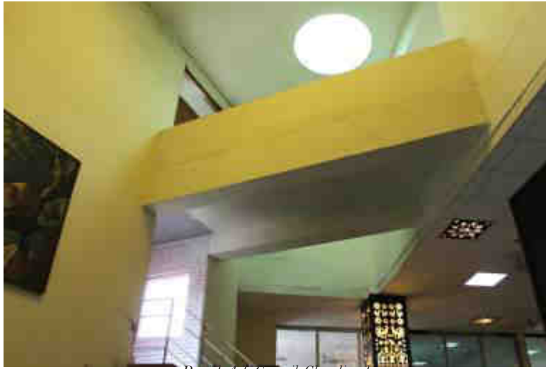
Punjab Arts Council, Chandigarh

He has performed the Herculean feat of earning three PhDs : 'Chandigarh and the Context of Le Corbusier's -Statute of the Land : A Study of Plan, Action, and Reality' 1991; 'CREATIVE MYSTICISM-