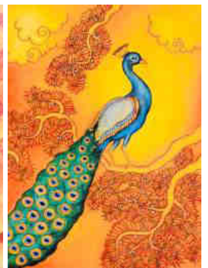
Alkaa Khanna 'Peacock' Acrylic on Paper 12x16 Inches

canvas and paper. The colours used are saffron, red, golden yellow, emerald green, coral red, blue and white. The use of colours are in 2 styles. One is Fresco style where colours are applied on a slightly wet surface. The other one where the colours are used on a dry surface is the dry fresco style. The outlines