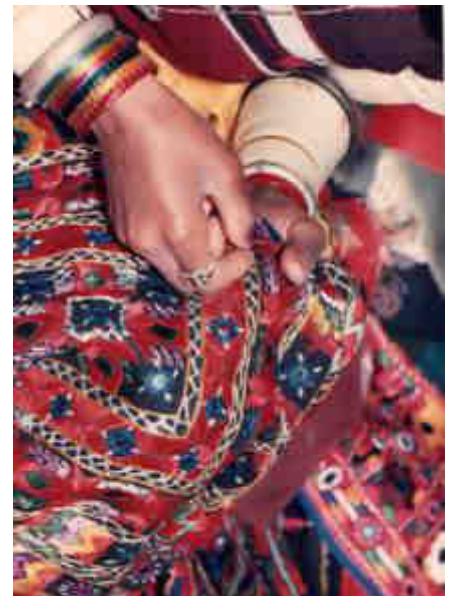
Creative hands doing Phulkari

Punjab have been well known in the world market for centuries. So fine was the Muslin that dhoti of 4 1/2 yards long and about 50 inches wide could be packed into a container of the size of a match box and Kashmiri Pashmina shawls could pass through the finger ring. This entire craft suffered for sometime but the new Handloom Development Programme has now given full support under the new schemes.