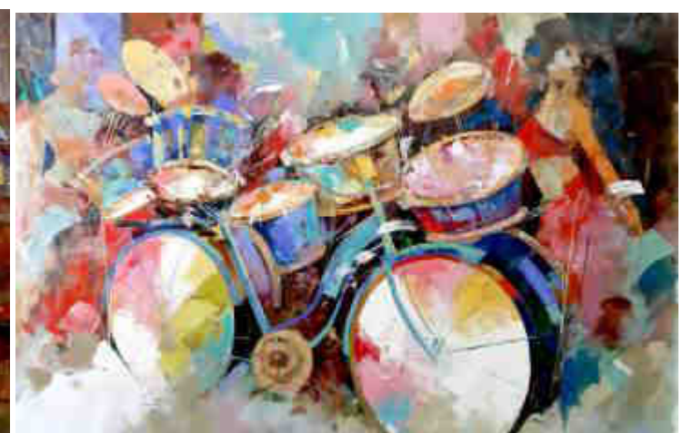
Sanjay Chakarborty 'Celebration' Oil on Canvas. 48x72 Inches