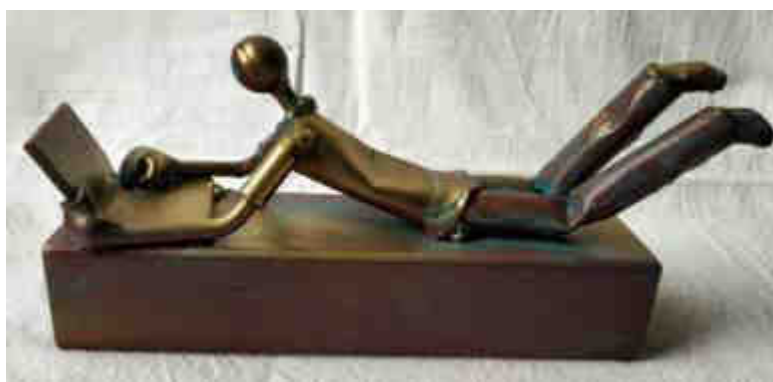
Prabhakar Singh 'Man on Laptop' Welded Iron with Brass Effect, 10 Inches Length

spiral rods, is the depiction of numerous thoughts going on in poet's mind. Sliced head breaks the monotony of the structure from where one can peep into the soul of the poet. When one looks at the sculpture from the front it appears to be a complete head, whereas the glance from the side exposes another hollow dimension of the artwork, which just shows the outline of the design. Housewife,