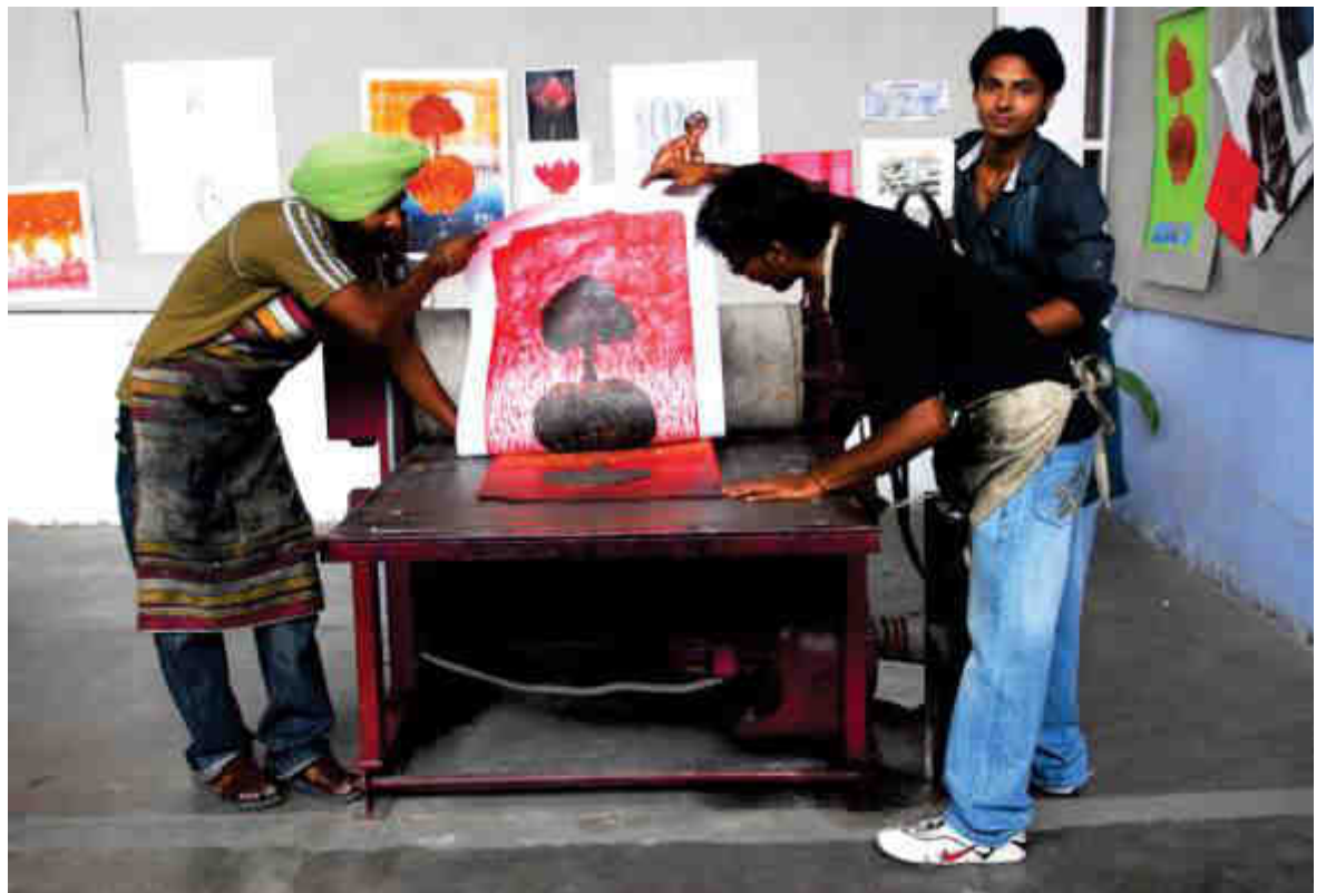
Studios of Government College of Art, Chandigarh.