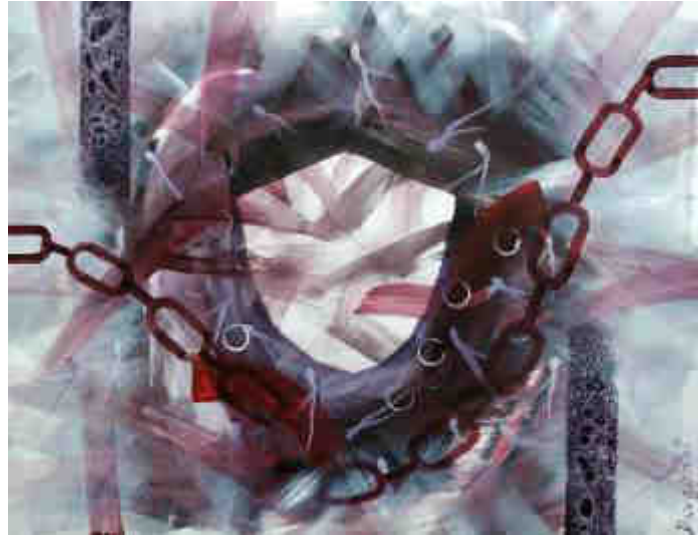
Devabrat Mahanta 'Lockdown' Acrylic on Paper, 23x18 Inches