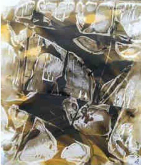
Devabrat Mahanta 'Mysterious Structures' Acrylic on Paper, 26x23 Inches

Apart from these, he draws some untitled paintings and he comments- 'The paintings remain untitled because the more I avoid defining shapes, the more freedom I have to let my viewers interpret my world the way they like.'