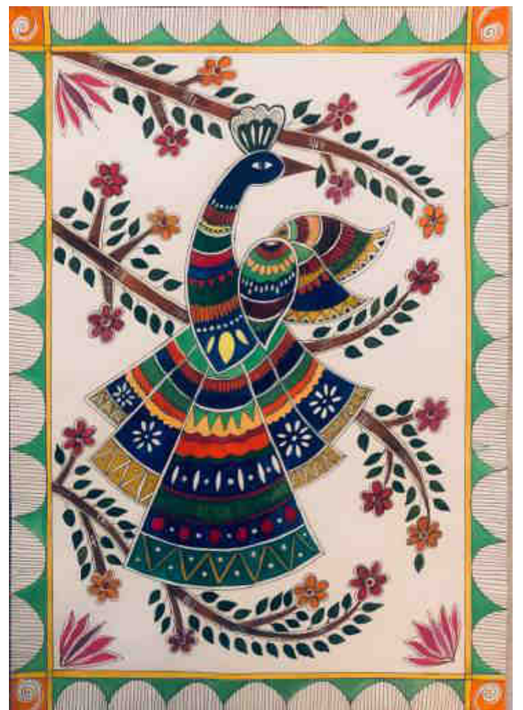
Alkaa Khanna 'Peacock' Acrylic on Handmade Paper, 11.5x16.5 Inches

bead, fibre, twig, grain, pin, plastic button, conch shell, feather, leaf of flower, he sees through it, smells it, hears it, and therein starts the ritual of being with it." Each part of India with it's own trees and plants, birds and animals, has inspired Indian folk artists to have multiple metaphors, series of symbols and innumerable images to build a rich treasure-house of art.