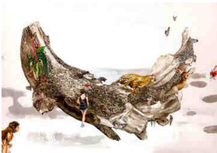
Renuka Sondhi Gulati 'The Living Ark-3' Oil & Acrylic on Canvas, 36x48 Inches

The six paintings in Renuka's Living Ark series show various intersections of women and nature. Her works are strongly reflective