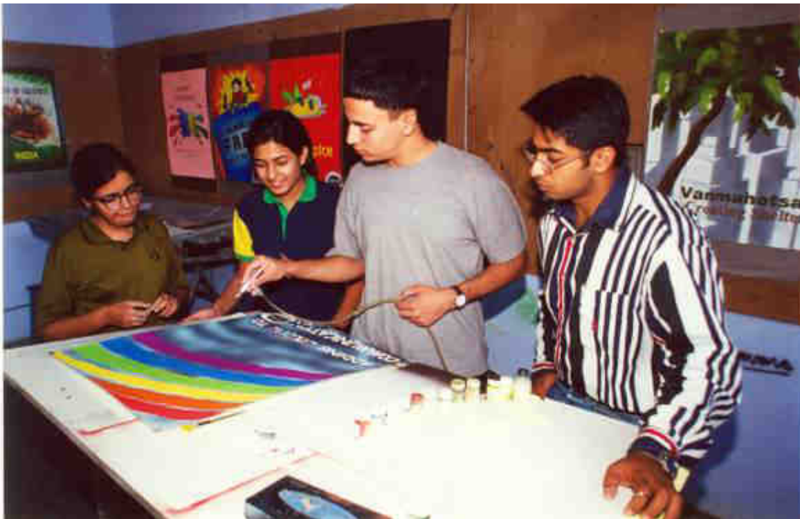
Studios of Government College of Art, Chandigarh.