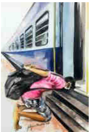
Watercolour on Paper by Falguni Mehta

I have created a series of 12 paintings of migrants.'