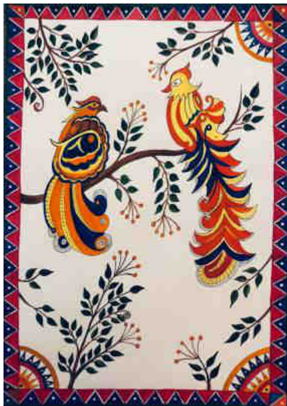
Alkaa Khanna 'Nature' Acrylic on Handmade Paper, 11.5x16.5 Inches

Madhubani narratives feature divine forms, stories, flora, fauna. The duality of life/death, man/woman, joy/sorrow etc in the imagery represent a holistic universe. Sita and Rama, Radha and Krishna, Shakti and Shiva, Sun and Moon, Flora and Fauna are depicted beautifully in the art scapes. A 1965 draught in Mithila region opened a possibility for the wall art to move to handmade paper and make it available for sales. It