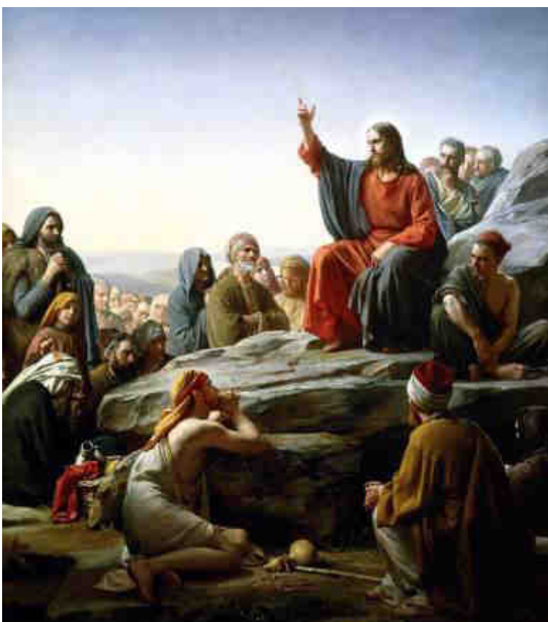
Carl Bloch 'Sermon on the Mount' 1877

At another level, Iconography witnesses questions regarding conventional meanings of symbols owing to evolution of thought