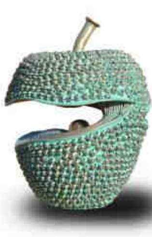
Prabhakar Singh 'Apple 29' Brass Ankelet, 18 Inches Height