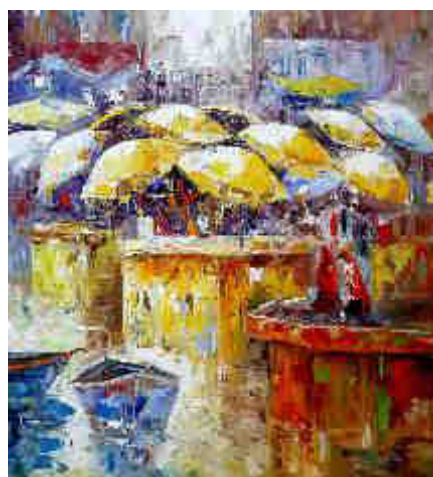
Sanjay Chakarborty 'Ganges' Oil on Canvas, 22x24 Inches