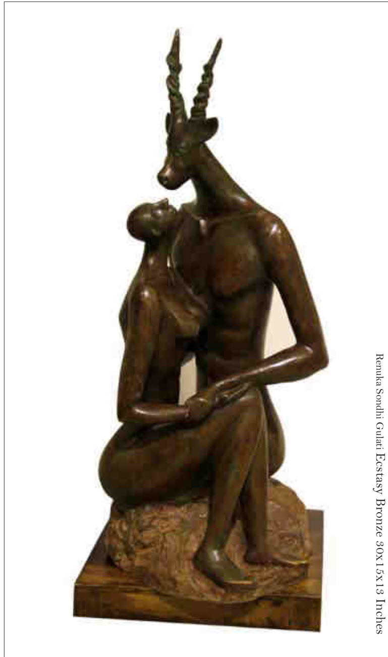
Renuka Sondhi Gulati Ecstasy Bronze 30x15x13 Inches