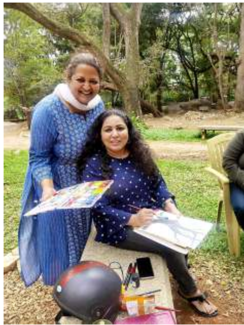
Catching up with work and friend