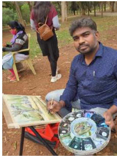
Exploring different media