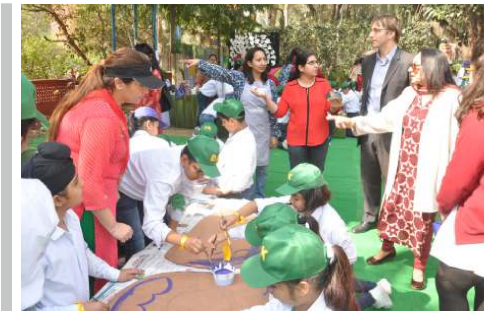
Principal taking pride in showing the works of students to visitors and members of management.

I believe talent can suddenly flower even in later school life. As far as