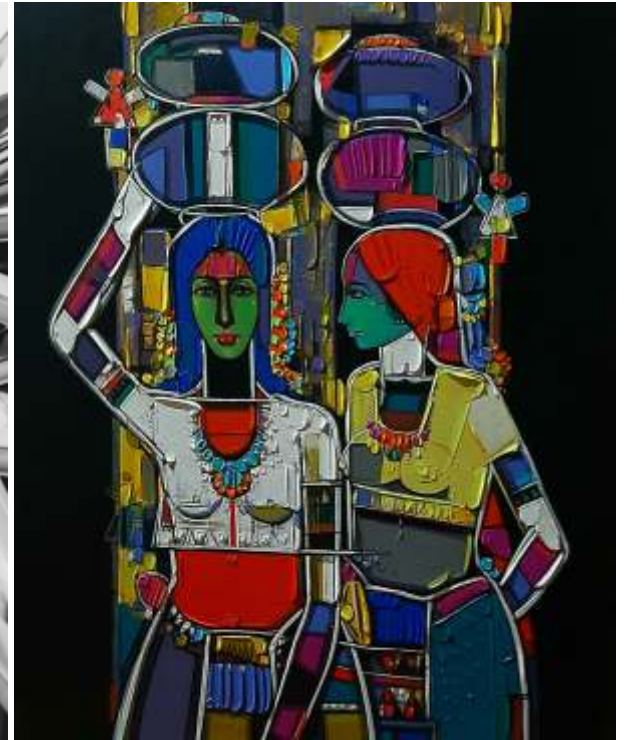
Girish Adannavar 'Early morning' Acrylic on canvas 36x30 Inches