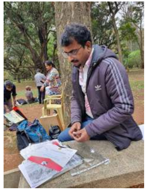
Artists among nature

If you would like to have your Art Event information on Pages of