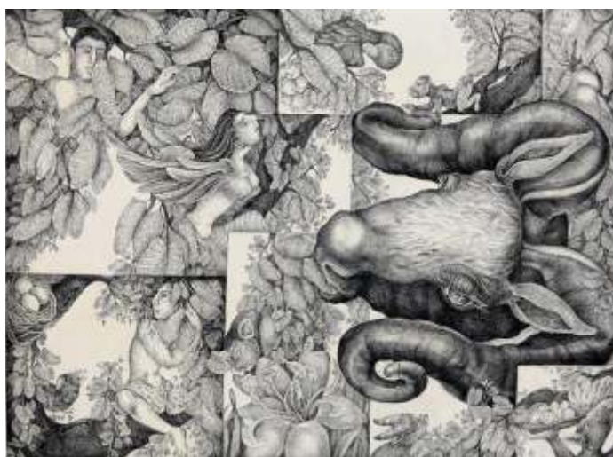
Gauri Vemula 'Zodiac Series-5' Pen & Ink on Paper 2014

Art Observer Syndicate artobserver.in@gmail.com