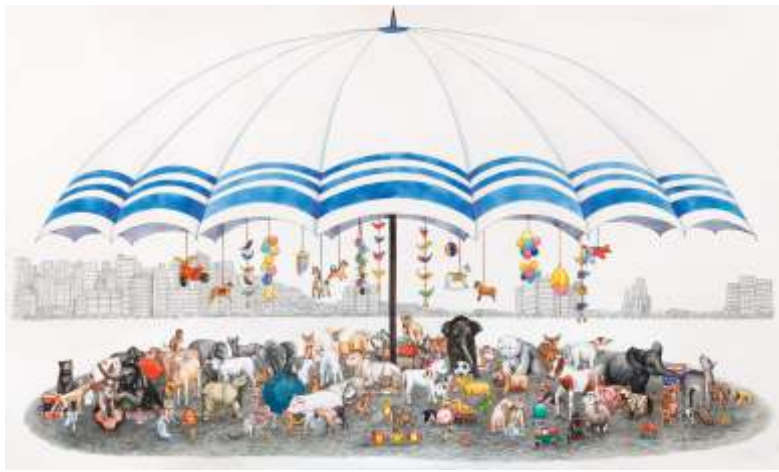
Lal Bahadur Singh 'Untitled' 31x52 Inches Watercolour on Paper, 2019

frequently encountered stylized representations of cows, trees and birds in Lal Bahadur's paintings are emblematic in nature yet rooted with a strong indigenous essence, marked by their folksy treatment. They celebrate the joy, festivities and struggles of village life. These traditional motifs are grounded on socio-religious moorings, cultural practices and share close ties with the sustenance and livelihood of rural people. Thus, these visual metaphors theorize the changing