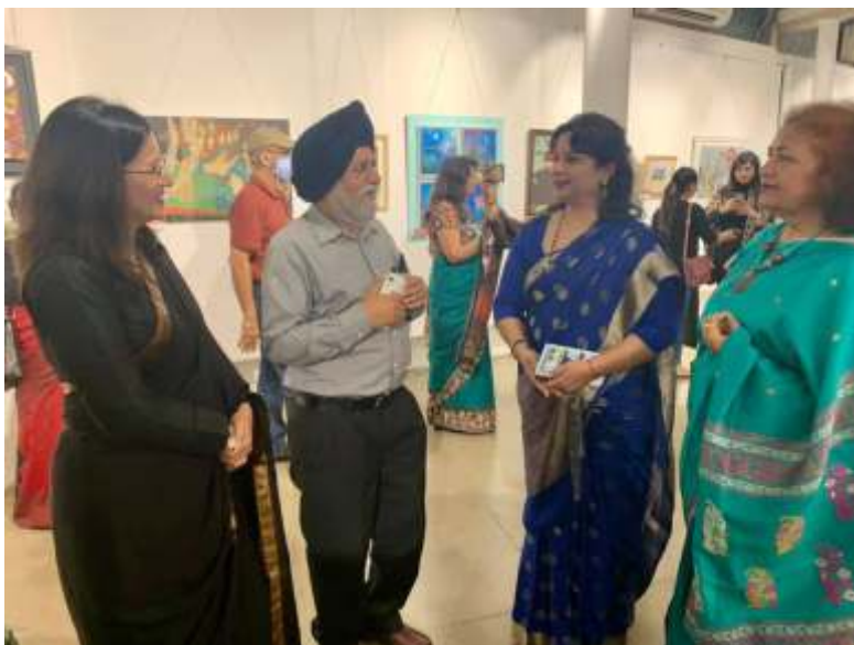
'Feminine Fables' National Art Exhibition on women's day at Government Museum Art Gallery Chandigarh 3rd to 8th March 2021