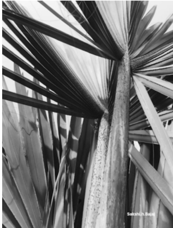
Sakshi Bajaj 'Change your perspective change your life'