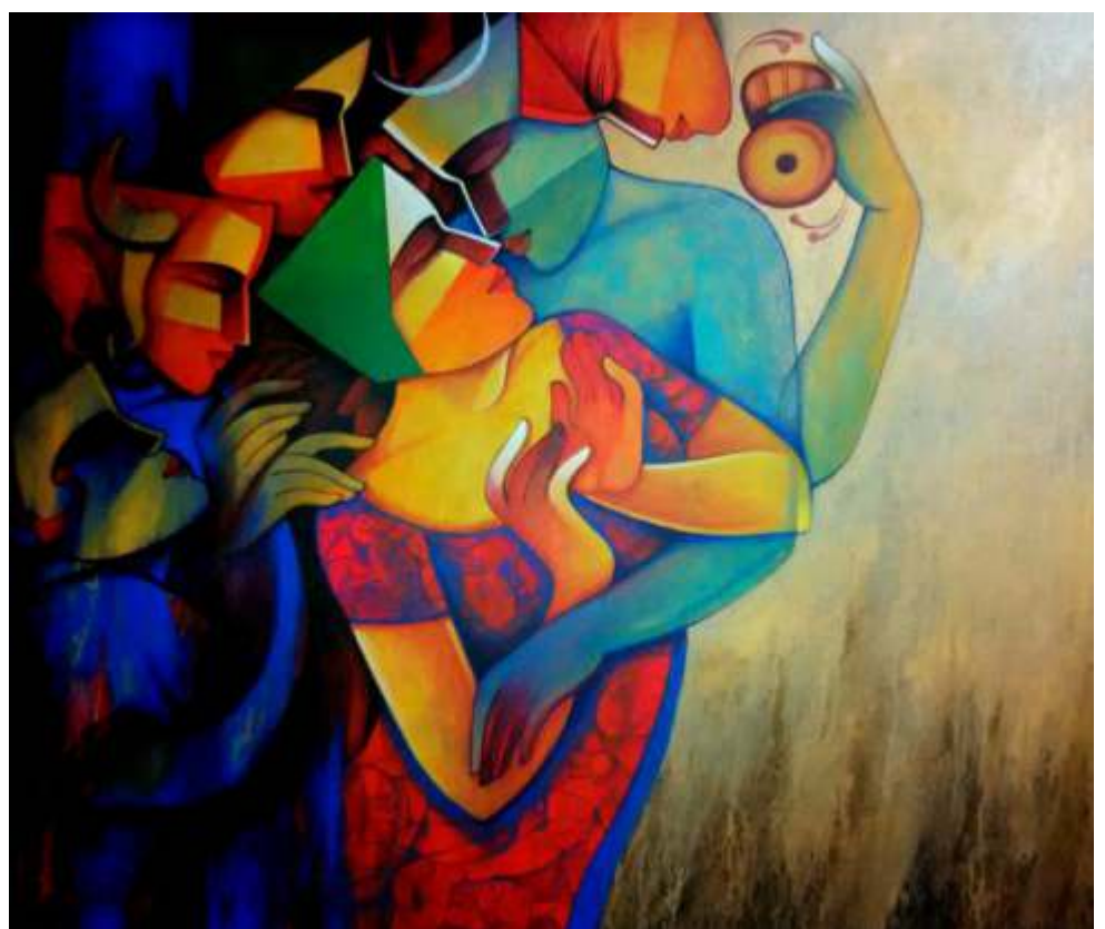
Naval Kishore 'Shiva' Acrylic on Canvas 36x42 Inches 2020