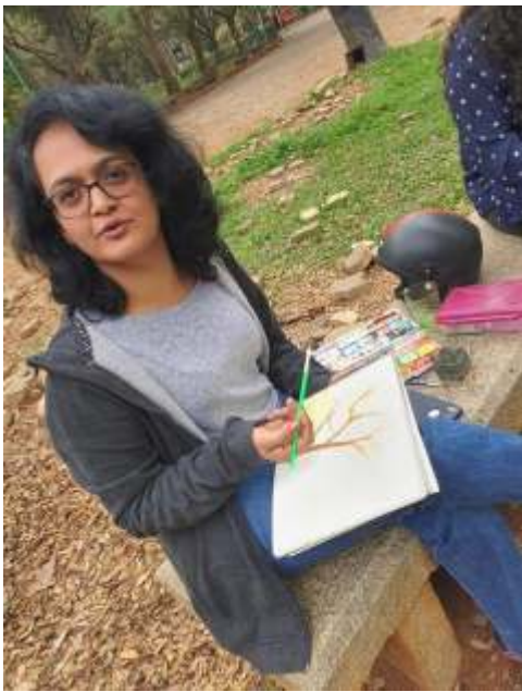
Enjoying the nature