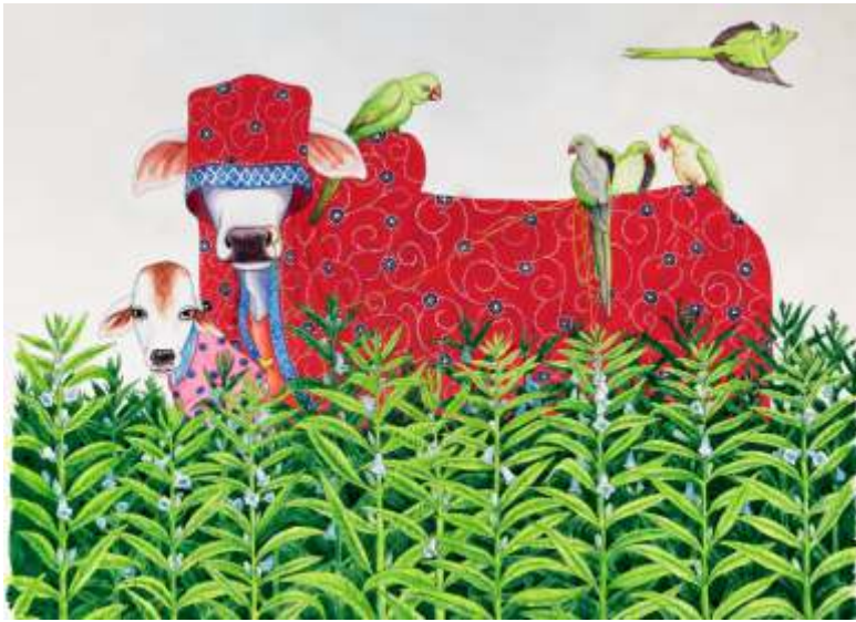
Lal Bahadur Singh 'Untitled' 22x30 Inches Watercolour on paper, 2019

Born in 1985, Lal Bahadur Singh has come a long way. Lal Bahadur Singh's paintings celebrate the journey of societal evolution from agrarian culture to a modernized state, centering on the indispensable relationship shared by humans with elements of nature. Painted in bright yet lyrical variegated hues, coalesced with delicately rendered intricate patterns, the paintings are aesthetically pleasing, displaying the rudimental elements of nature and rural life, which are pictured as symbolic motifs. Such as, the